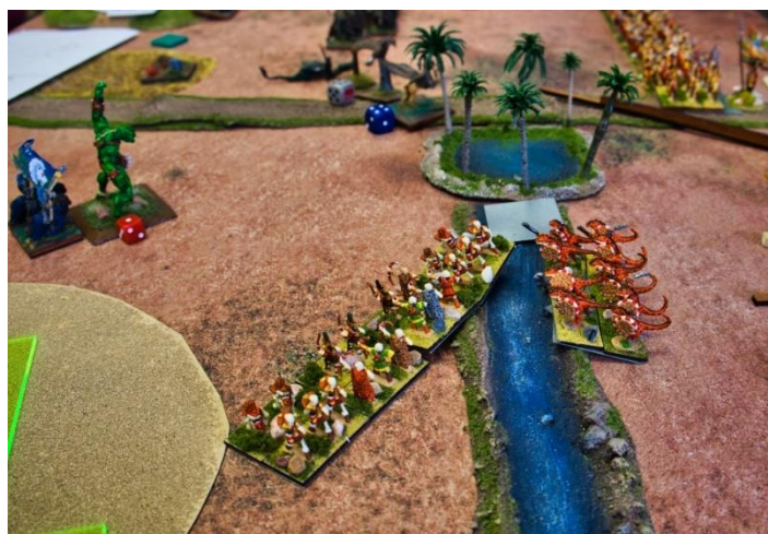
Skeletor Archers Ambush the not-so-jolly Green Giant

On their right flank the Elves' not-so-jolly Green Giant pushed forward covered by the Elven Aerials overhead. Undead Skeletor archers sprang out of the gully in ambush and took the Giant under fire, inflicting a hit. The Elven Aerials swept into the rescue, inflicting losses on the Skeletors. This brought the Elven Aerials in range of a second ambush, this one featuring the Tyrannosaurus Rex accompanied by Velociraptors. Things went downhill from there for the Elven Aerials. Their Dragon momentarily broke free but was overwhelmed by the Amazon Dragon and three flights of Pterodactyls that had swung around to approach from the rear.