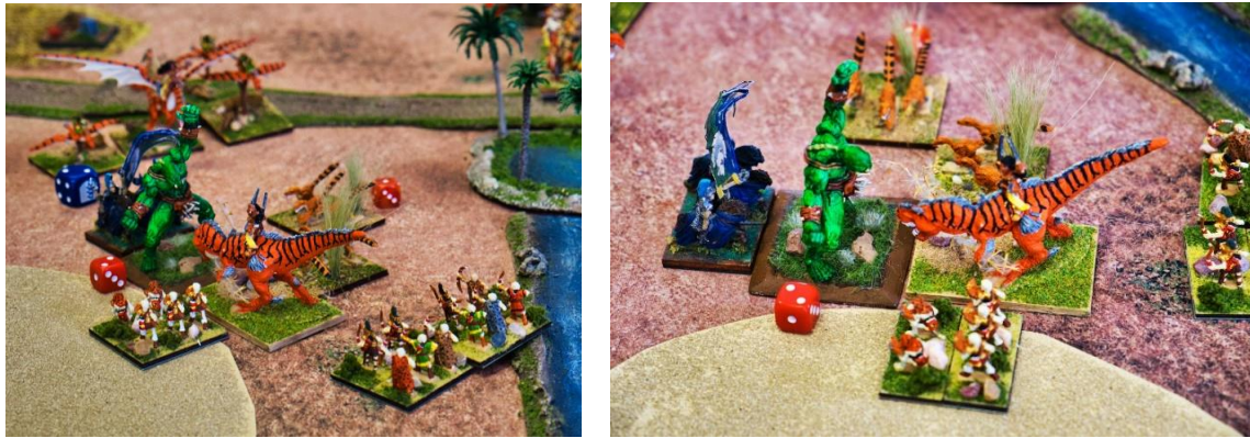
The Green Giant gets swarmed.

now isolated and depleted Giant. The Giant put up a brave fight, but the odds against him were overwhelming. In the aftermath of the carnage the Rex Rider struggled to regain control of her flesh-frenzied beast while the rest of the command regrouped for further operations.