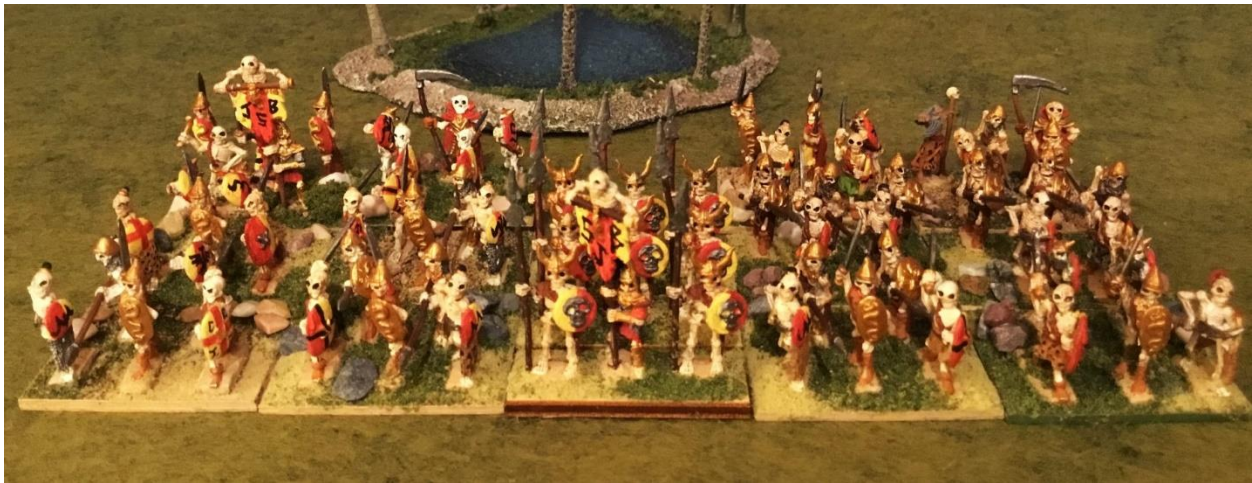
Undead Hordes Shuffle to the Attack

Undead can be fielded as any traditional ADLG unit type, but most appear as Levies (Hordes). They are cheap, generally mediocre, unmaneuverable, and virtually invulnerable to missile fire. They are fearless but incapable of being inspired by Commanders or Heroes, and thus cannot Rally. If a column of Hordes takes losses, the hit goes to last unit in the column, leaving the first unit unaffected. The Undead feed in from the rear without implications for their morale. This makes them an ideal "Tar Baby". They are not very lethal but can tie up far more expensive troops for prolonged periods since they have no fear and it takes so long to kill them all (again).