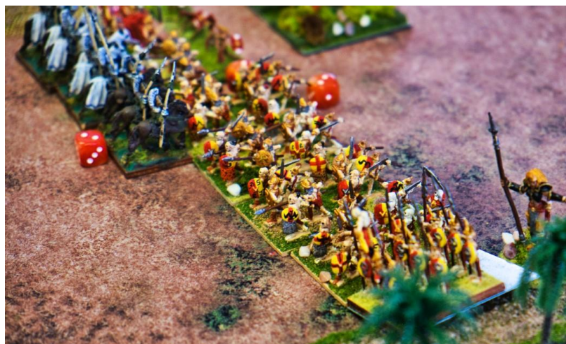
Elven Knights Hit the Undead Horde

While all this was happening on the Elven right flank, Elven Knights and Medium Cavalry pushed forward through the open terrain in the center and Elven Blades and Spearmen, accompanied by artillery, negotiated the more difficult terrain on the Elven left flank. The great mass of a Skeletor Horde stretched across the center. The Elven Knights and Cavalry collided with this, inflicting heavy casualties. Unfortunately for them, the Amazon Carnotaurids were positioned to hit the Knights just as they were breaking through the Skeletors and swept them away. The Amazons ended up trading cheap Skeletor minions for valuable Elven Knights.