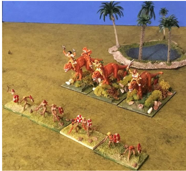
Carnotaurid Amazons advance behind a Screen of Scouts