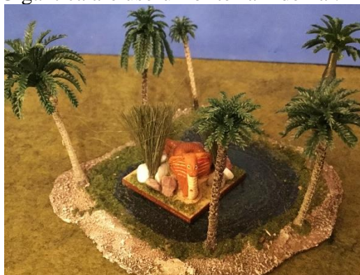
A Cobra Gigantica Lurks in the Oasis

Cobra Gigantica are huge venomous snakes packing sufficient venom to disable the largest opponents. They ambush from a Woods, Marsh, Brush, Dunes, Plantation, or Steep Hill but must remain at least partially in their original terrain feature. They are formidable against all opponents but particularly dangerous to larger creatures. If such a creature takes a cohesion loss it rolls a D6 in each subsequent enemy shooting phase and takes another hit if it rolls 1 or 2. This deadly erosion can only be arrested by a successful Healing Spell. Cobra Gigantica are useful for terrain denial.