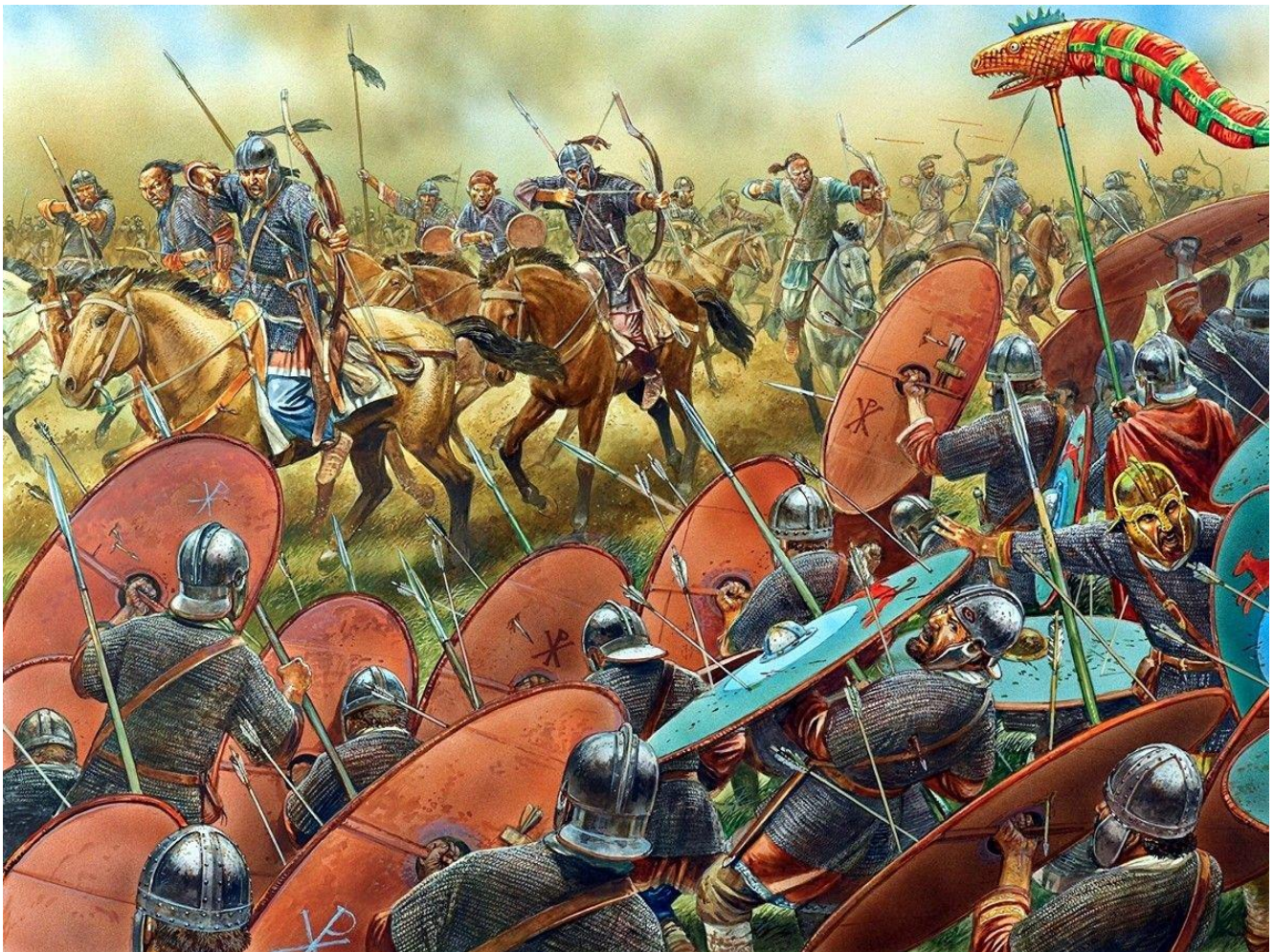
Battle of the Catalaunian Plains, 451AD.