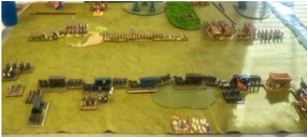
Another Look at the Hussite Line