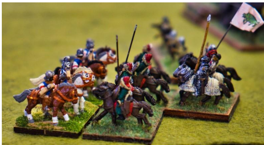
Medium and Light Cavalry Skirmish