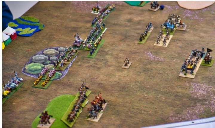
Scandinavians versus the Delhi Sultanate