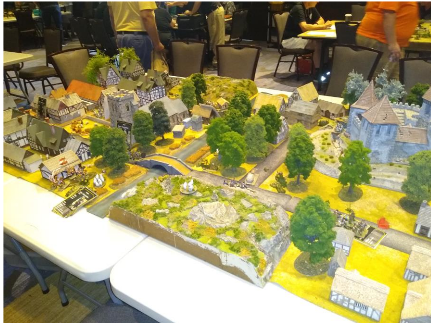
Medieval town at Historicon

CMH at that time had a seven member board; the President, Vice President (In Charge of programs), the Secretary, the Treasurer, the Historian, and two Members – at – Large, one of whom was last year’s president to provide continuity. We eventually incorporated. All went along fine but in the mid- 70’s membership declined to nine members and seven board members. When a dentist who was building a Fokker D-VII WWI bi-plane came in Ulan uniform and gave a brilliant presentation and we had that small a turnout we knew we had a problem. We decided to go into a hiatus while we figured out where to go from there. Where we went is next month’s story.