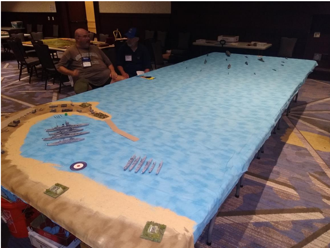
Mers-El-Kebir at Historicon