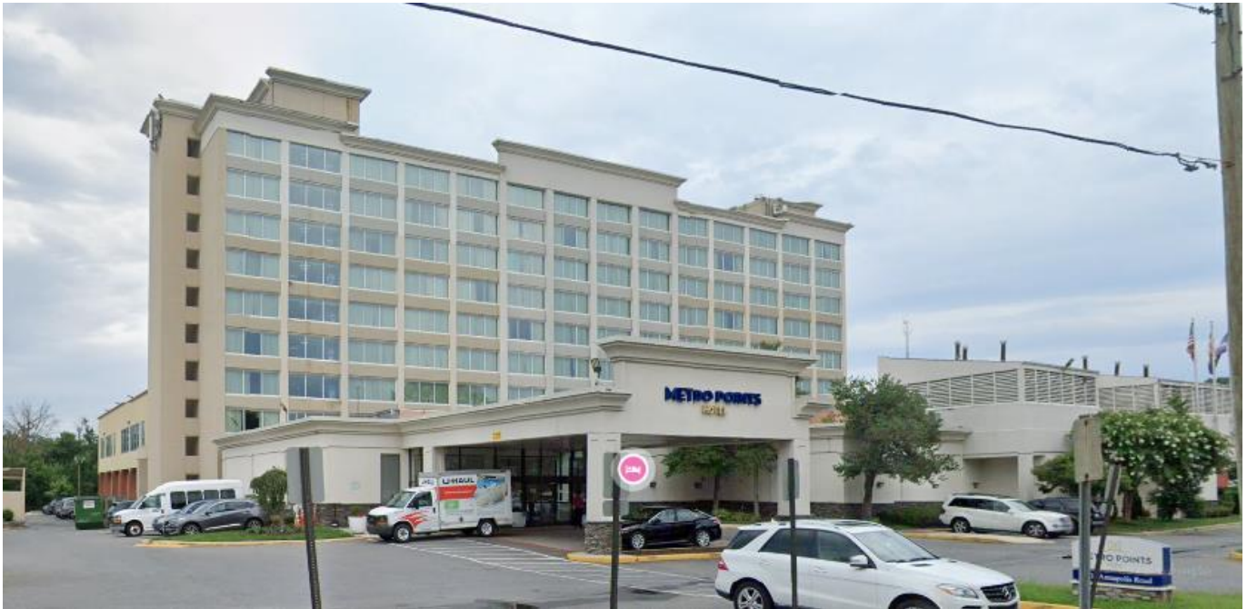
Sheraton Inn is now the Metro Points Hotel.

Gaming photos from Historicon 1984 can be found on this blog page: