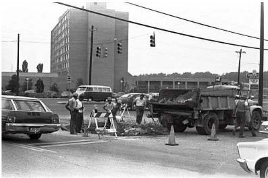
Sheraton Inn in 1973.

The first Historicon was held for three days in July 1984 at the Sheraton Inn in New Carrollton, MD. Over 900 attended with 67 events. There were 30 dealers there as well. Origins by contrast in 1984 had over 4000 attendees.