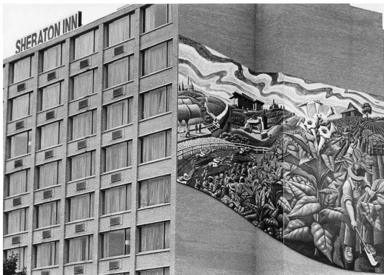
The Sheraton as seen with mural in 1981.