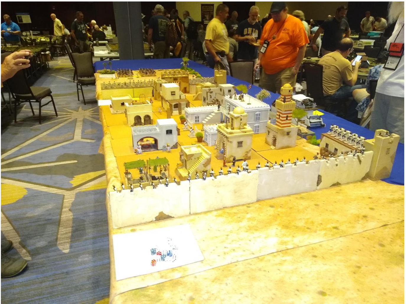
Walled town at Historicon