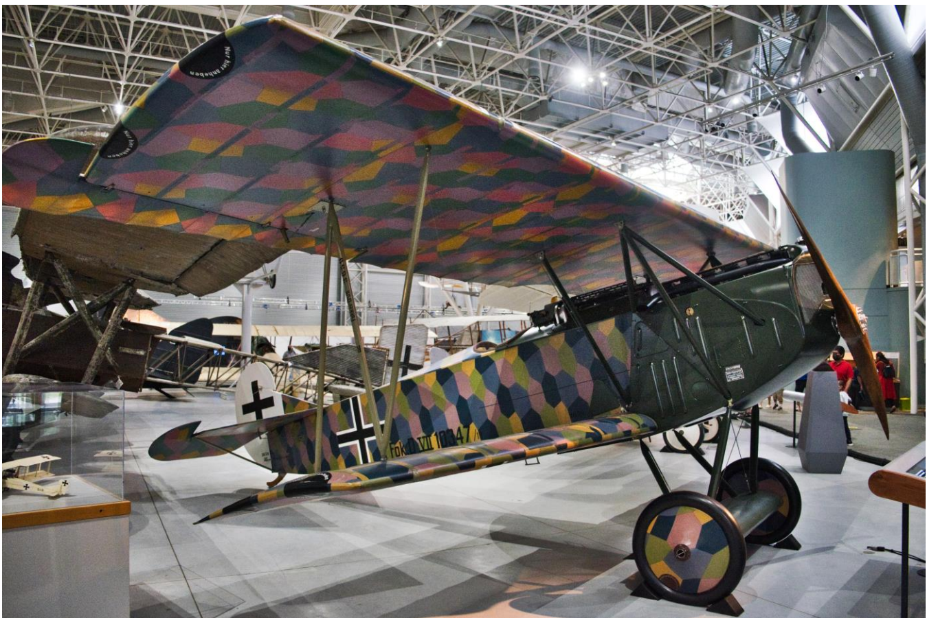
Fokker D.VII at the Canadian Aviation and Space Museum, Aug 2021.