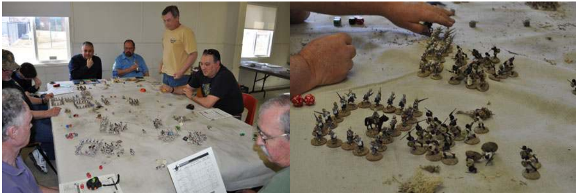
Game of the Month entry – The Sword and the Flame: Sudan Throwdown

Game of the Month Winner is highlighted in RED .