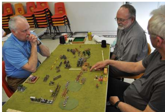
Game of the Month entry – DBA: Germans vs. Scandinavians