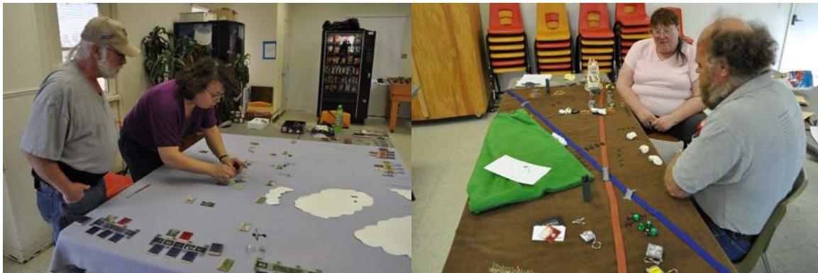
Game of the Month entries – Wings of War and WRG Microarmor

Unit of the Month Winner is highlighted in RED .