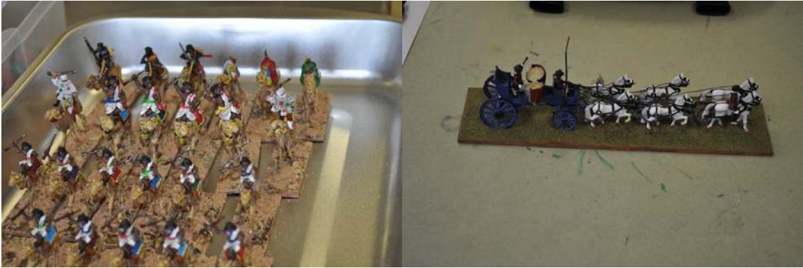
Unit of the Month entries – Colonial Sudanese troops and British Artillery Drum Wagon