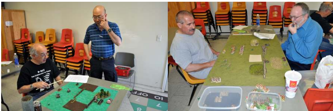
DBxx practice games

July is filled with various military related events. First is the 150 th anniversary of the Battle of Gettysburg, with commemoration events starting June 29 th and continuing through the rest of the year. July will also see West Wars, our very own convention, during the weekend of July 12-14 th . Historicon will be in Fredricksburg, VA the weekend of July 18-21. Planning is also well underway for Tacticon with several club members running games at the fall convention.