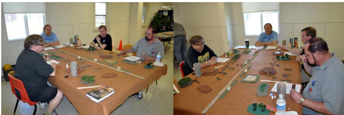
Game of the Month entry – 1866 Austrians vs. Prussians

FNF (TBD) may or may not occur this month due to a lack of a scheduled host.