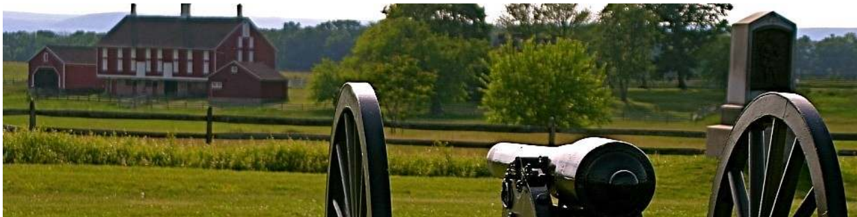
Gettysburg National Military Park (National Park Service)