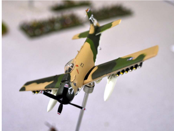
Unit of the Month entry – Skyraider