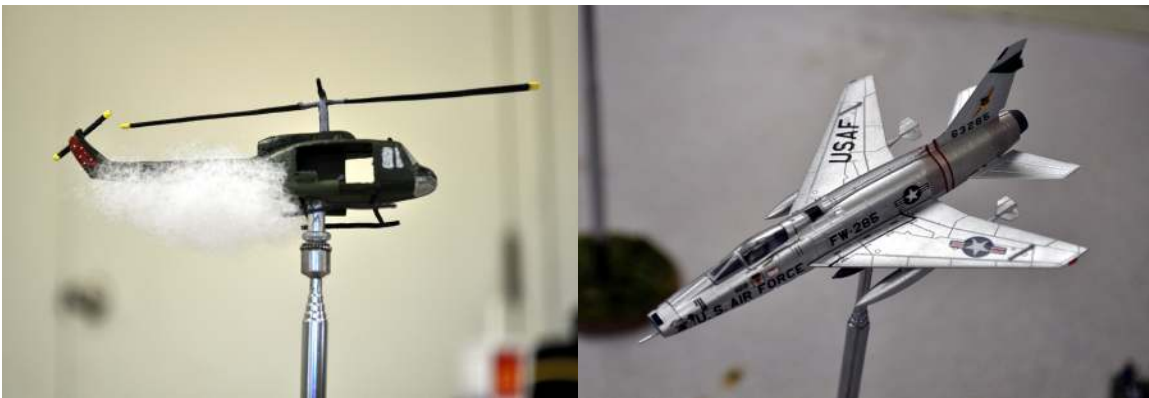
Unit of the Month entries – Huey Hog and F100 Super Sabre

Unit of the Month Winner is highlighted in RED .