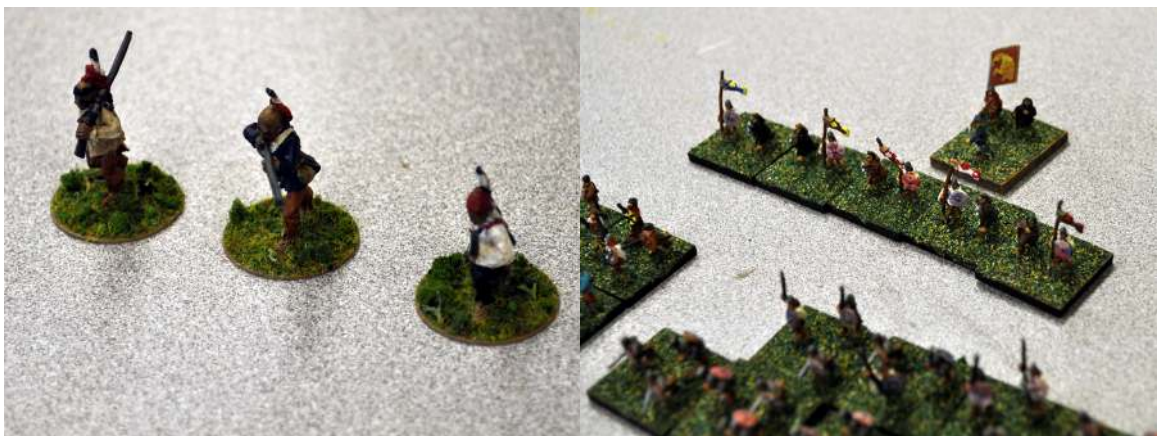
Unit of the Month entries – Iroquois and Medieval Saxon army