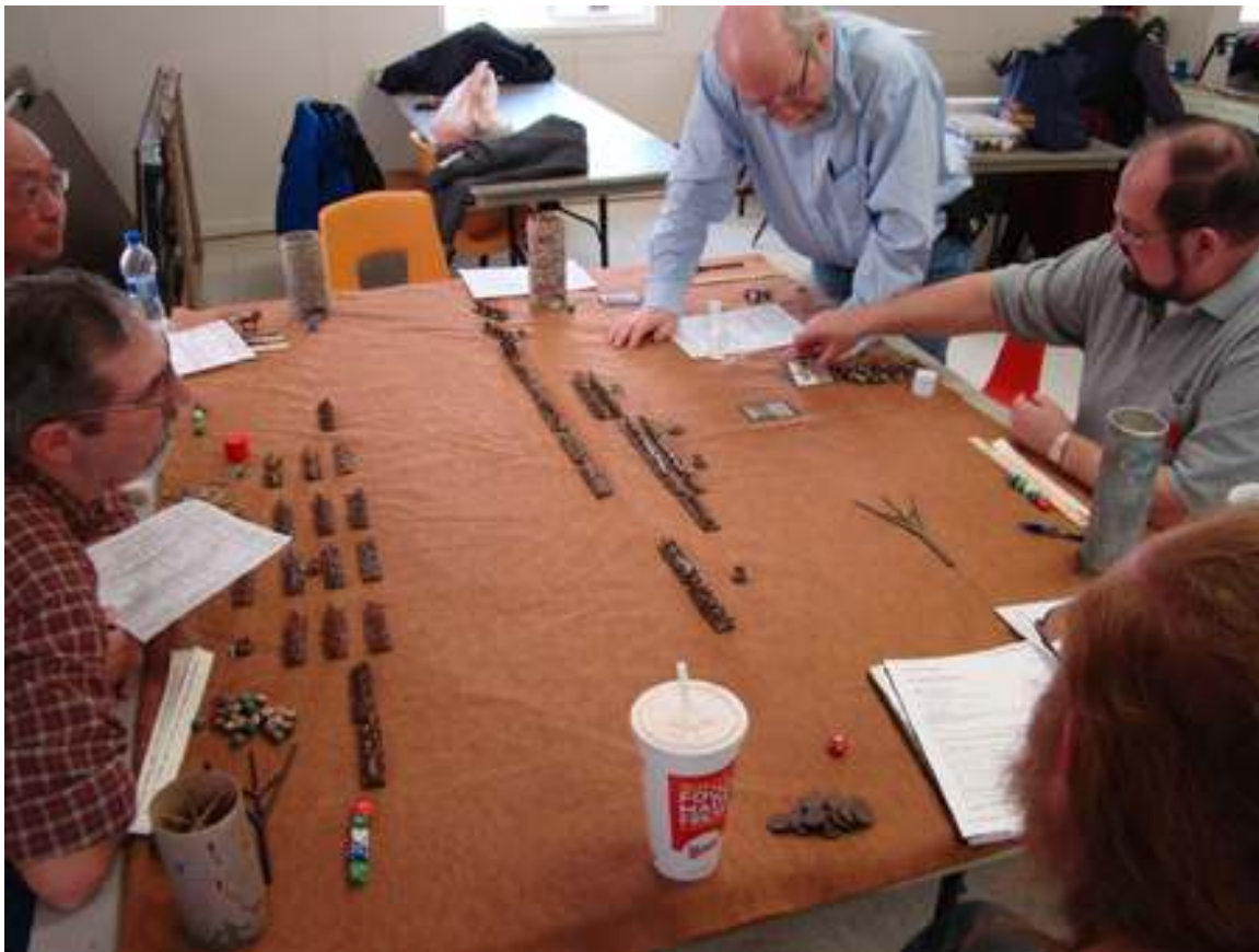
Pulse of Battle – Punic Wars