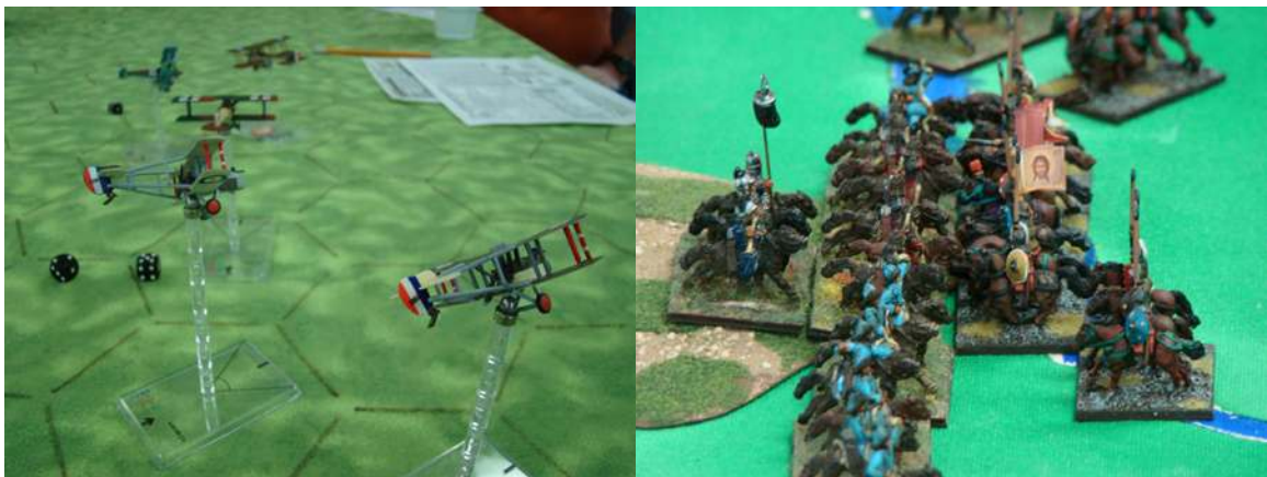
Knights clash on the battlefield

8120 Sheridan Blvd. Building-C Suite-200 Westminster, CO 80003