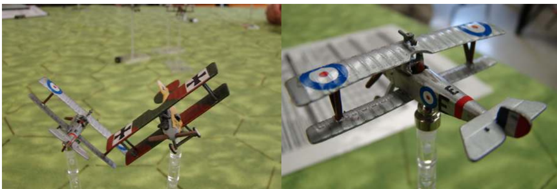
Canvas Eagles battle it out over France