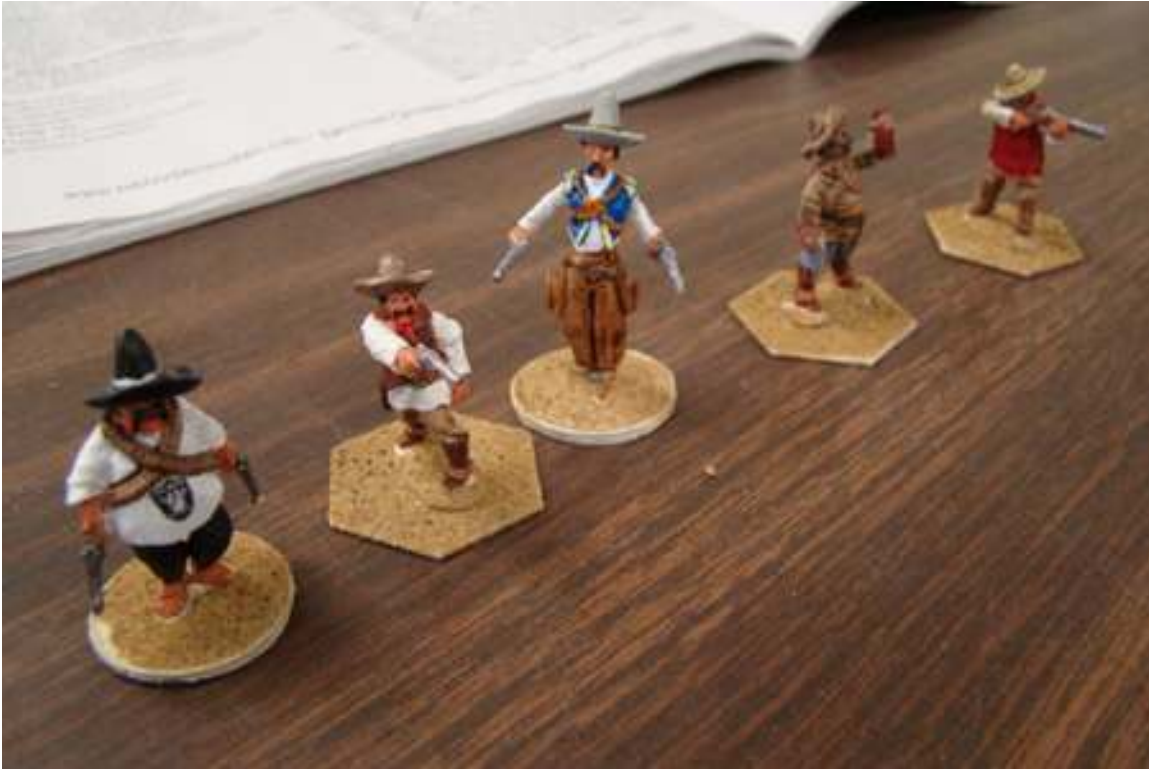
Unit of the Month entry – Mexican Bandits

Unit of the Month Winner is highlighted in RED .