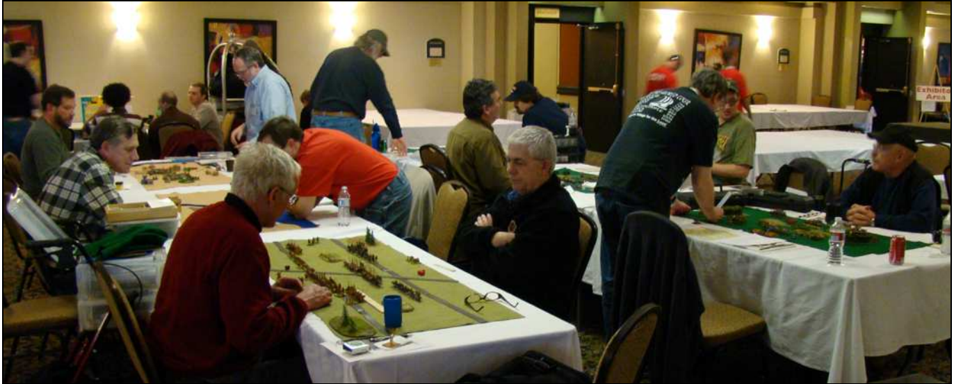
DBA Tournament at Genghis Con

Each month CMH members host games at the monthly meeting. This award is for the effort put out by the host. The winning host receives a gift certificate from Valhalla's Gaming Center in Wheat Ridge, Colorado. We thank Valhalla's Gaming Center for its support.