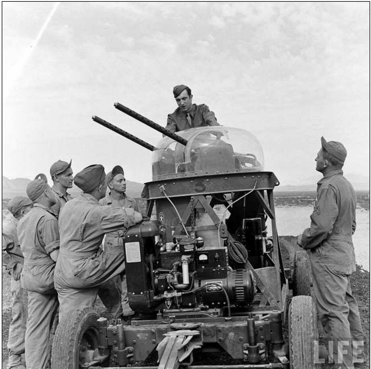
Las Vegas Gunnery School in 1942. The base was opened in January 1942. The site is now known as the Nellis Air Force Base. I picked this photo because I visited Las Vegas for the first time in February.