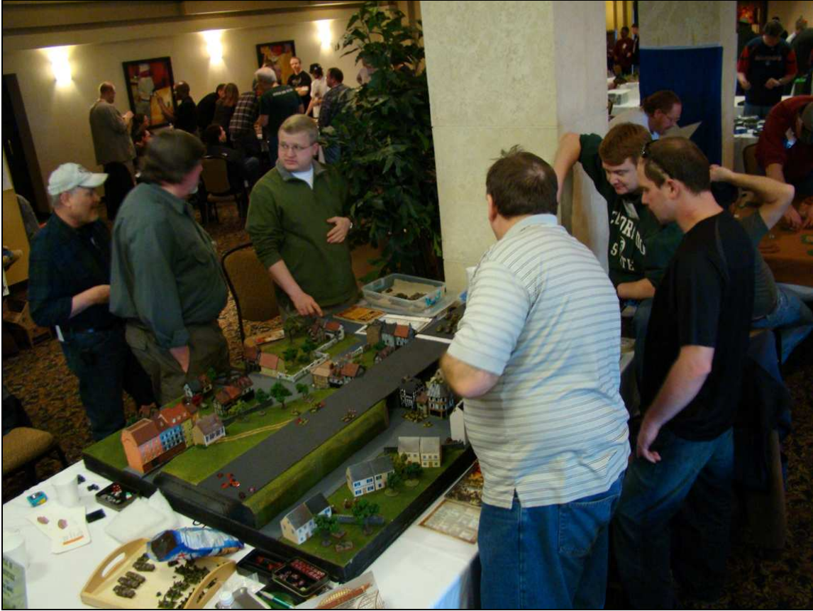
Flames of War at Genghis Con