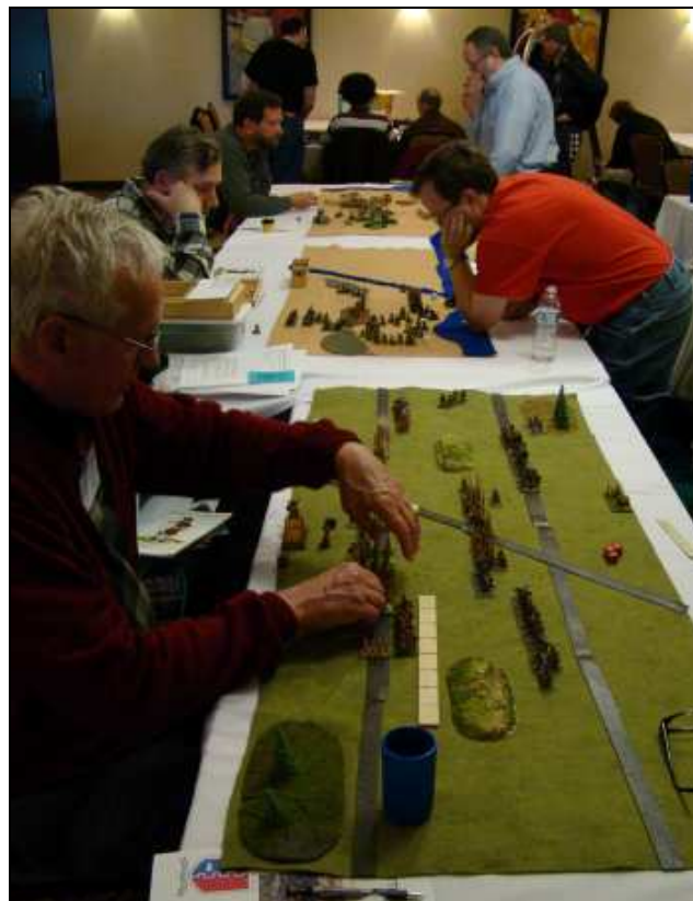
DBA Tournament at Genghis Con